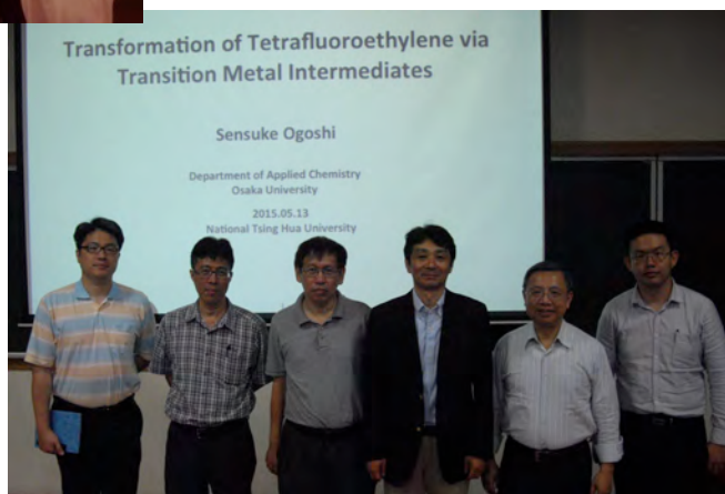
National Tsing Hua University