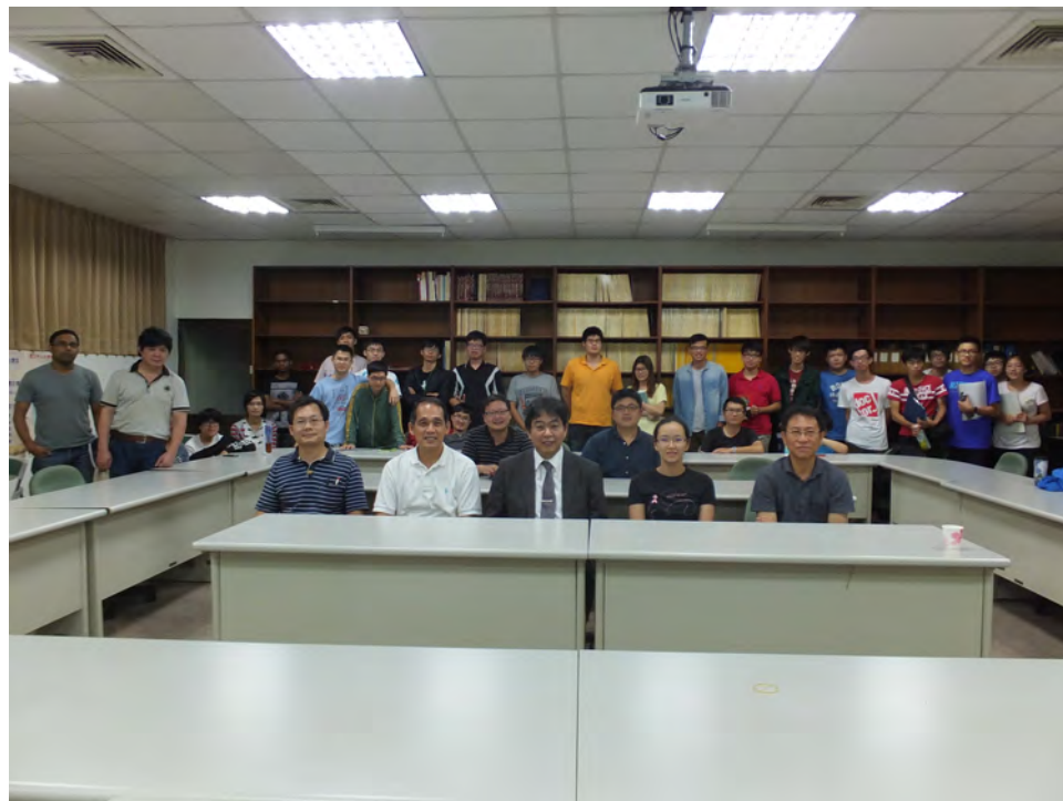
National Sun Yat-sen University