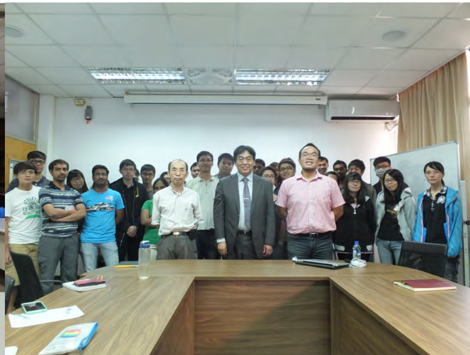
National Taiwan Normal University