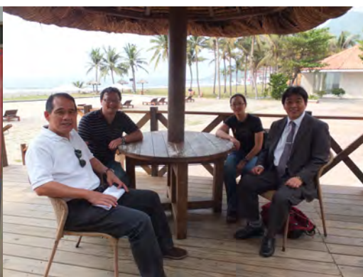
National Sun Yat-sen University