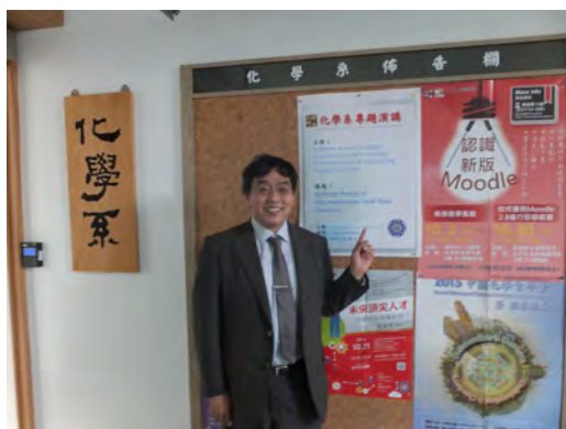
National Taiwan Normal University