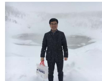
At Hokkaido hot spring (雪株父)