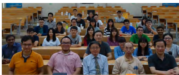
National Taiwan Normal University (國立台灣師範大學)