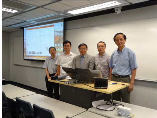
Hong Kong University of Science and Technology (香港科技大學)