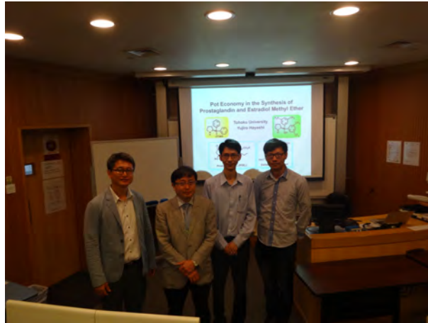
Chinese University of Hong Kong (香港中文大學)