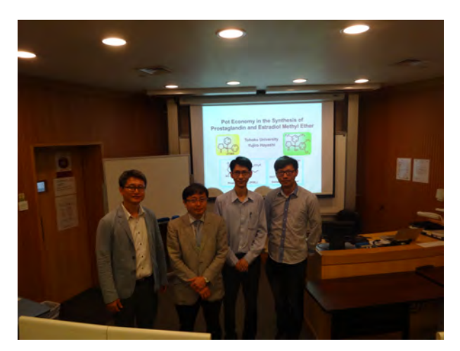
Chinese University of Hong Kong (香港中文大學)